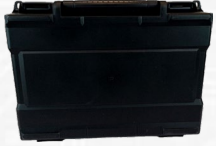
HARD PLASTIC CARRY CASE